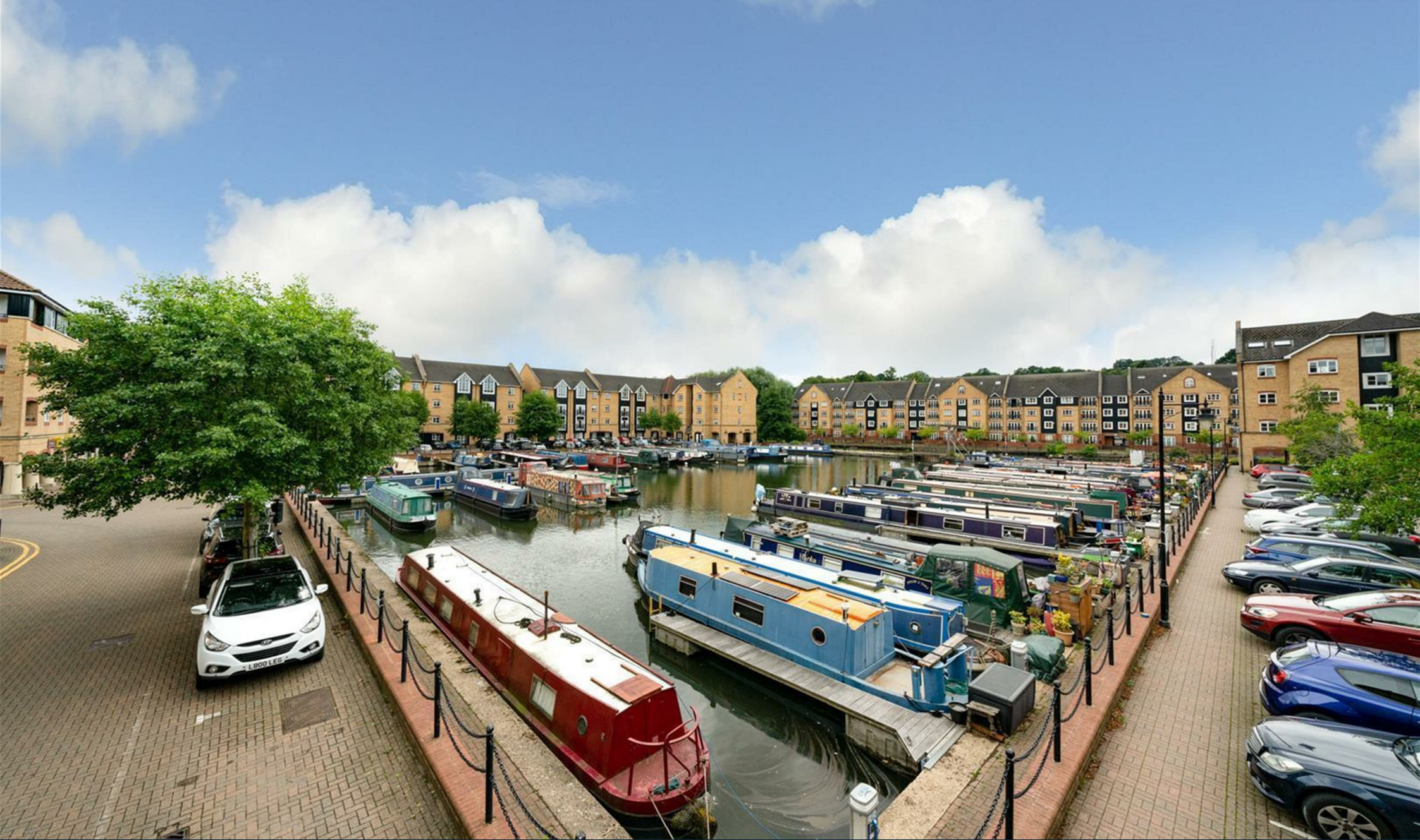
Evans Wharf Hemel Hempstead, HP3 9WN